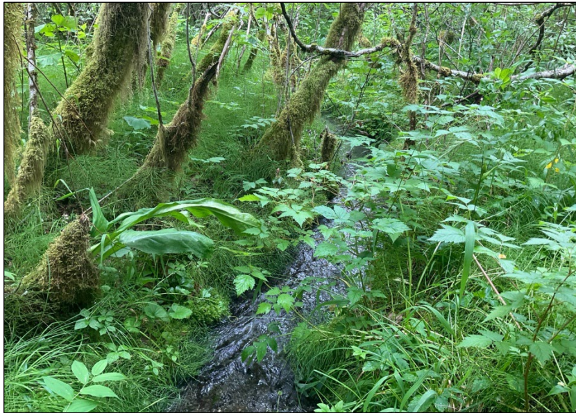
Figure 3.—Looking downstream at waypoint 673.