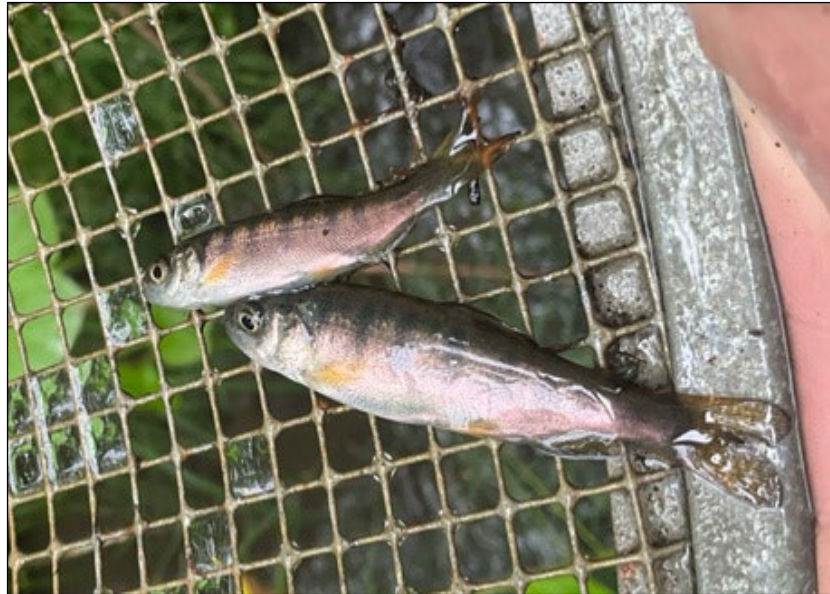
Figure 1.–Coho salmon caught at waypoint 673.