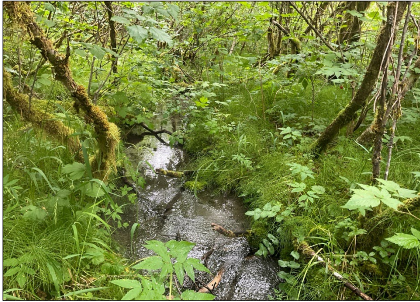
Figure 2.—Looking upstream at waypoint 673.